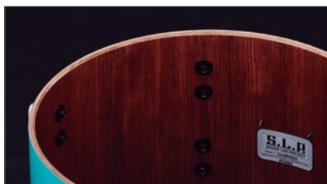
6.0mm, 9ply Bubinga Shell

Shell: 6.0mm, 9ply Bubinga Size: 12”x7” Hoops: Sound Arc Hoop (6 hole) Batter side: 2.3mm Snare side: 1.6mm Lugs: MSL-SCT Strainer / Butt: MLS30A/MLS30B Snare Wire: Starclassic 20-strand Carbon Steel Snare Wires Head: Evans® Genera Dry / Evans® Snare Side Finish: Electro Turquoise (ETQ)