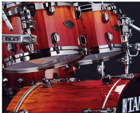
Vermillion Bosse Fonce Fade (VBF)