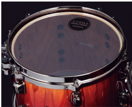
Shell: TT/FT/SD: 6mm, 4ply Birch + 1 outer ply Bosse Fonce + 2 inner ply American Black Walnut