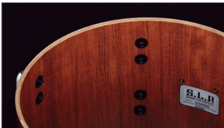
6.0mm, 9ply Bubinga Shell