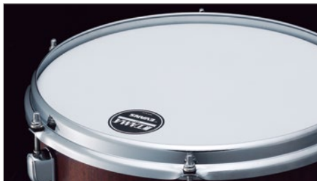
Sound Arc Hoop (6 hole)