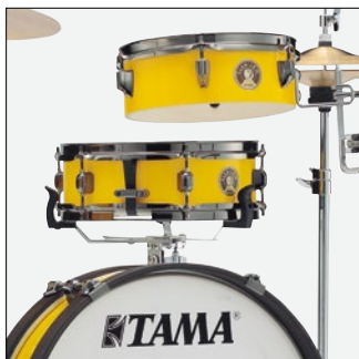
Electric Yellow (ELY)