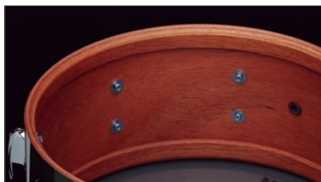
6.0mm, 8ply Mahogany Shell w/ 6.0mm Sound Focus Rings

Shell: 6.0mm, 8ply Mahogany w/ 6.0mm Sound Focus Rings Size: 14"x6.5" Hoops: Customized Brass Mighty Hoop (8 hole) Lugs: MSL90S Strainer / Butt: MLS50A / MLS50B Snare Wire: 20-strand Carbon Steel Snare Wires Head: Remo® Coated Ambassador / Remo® Snare Ambassador