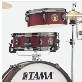
Burgundy Walnut Wrap (BWW)