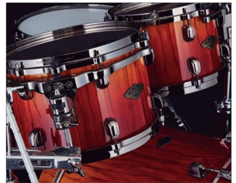
Black Nickel Shell Hardware