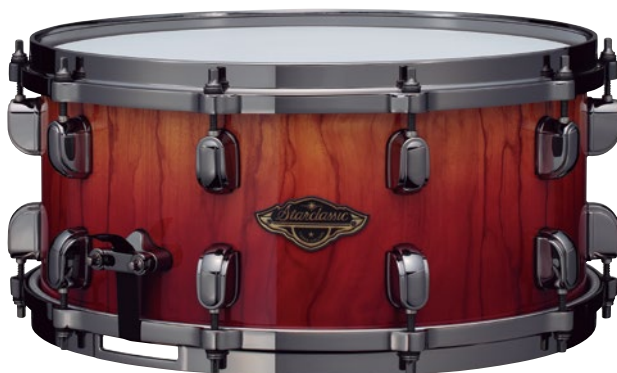
WBS65BB Size: 14"x6.5"