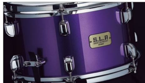
Galactic Purple (GPP)