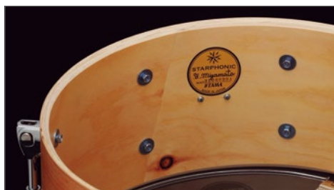
8.0mm, 9ply Spruce Shell

Shell: 8.0mm, 9ply Spruce Size: 14"x6" Hoops: Grooved Hoop Lugs: Freedom Lug Strainer / Butt: MLS50A / MLS50B Snare Wire: Super Sensitive Hi-Carbon Snare Wires (MS20RL14C) Head: Evans® G1 Coated / Evans® Snare Side Finish: Satin Natural Spruce (SSC)