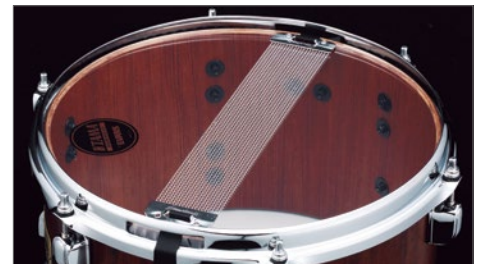
20-strand Carbon Steel Snare Wires