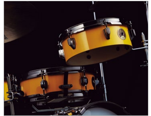
Black Nickel Shell Hardware