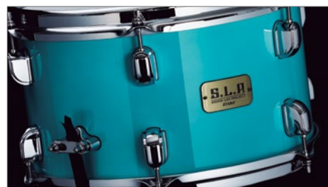
Electro Turquoise (ETQ)