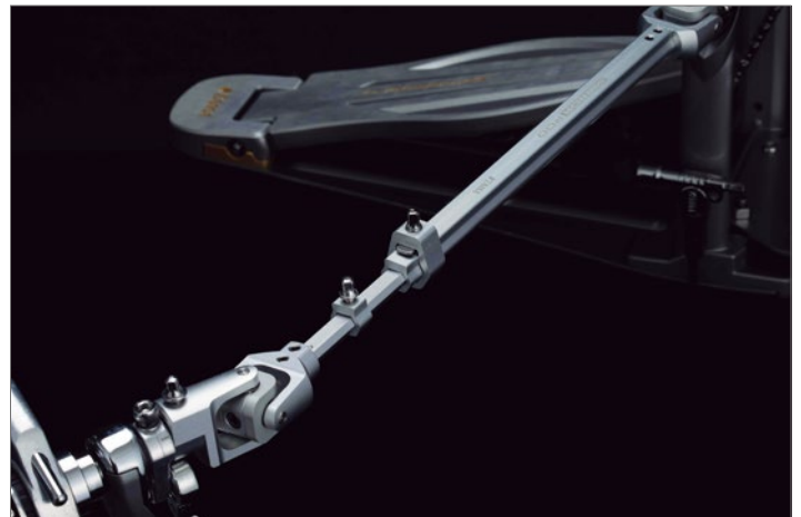
Easy & Quick Setup / Memory Lock