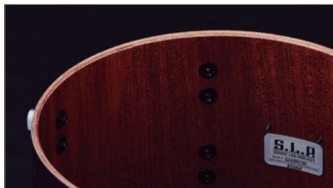
6.0mm, 9ply Bubinga Shell

Shell: 6.0mm, 9ply Bubinga Size: 12”x7” Hoops: Sound Arc Hoop (6 hole) Batter side: 2.3mm Snare side: 1.6mm Lugs: MSL-SCT Strainer / Butt: MLS30A/MLS30B Snare Wire: Starclassic 20-strand Carbon Steel Snare Wires Head: Evans® Heavy Duty Dry / Evans® Snare Side Finish: Galactic Purple (GPP)