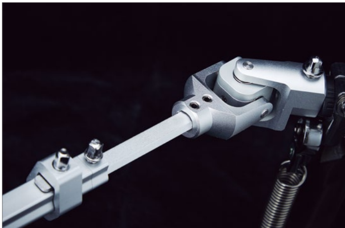
Zero Latency with Ball Bearings