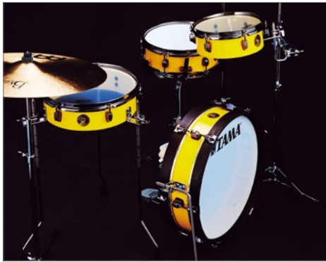
Ultra-Shallow Pancake Shell