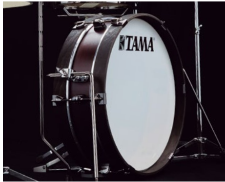
Vintage Inspired Bass Drum Hoop