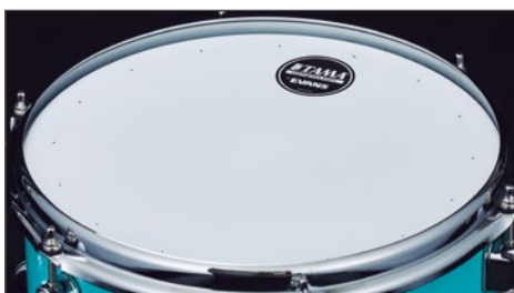
Evans® Genera Dry Drumhead