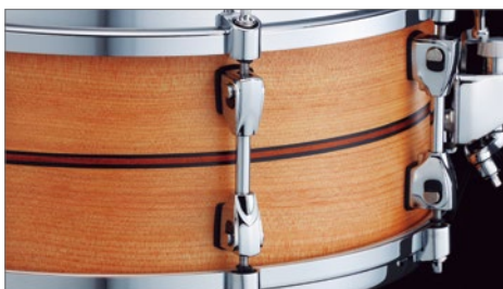
Brown Finished Inlay