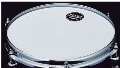
Evans® Heavy Duty Dry Drumhead