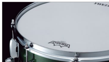
Customized Brass Mighty Hoop (8 hole)