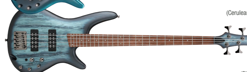
SVM (Sky Veil Matte)