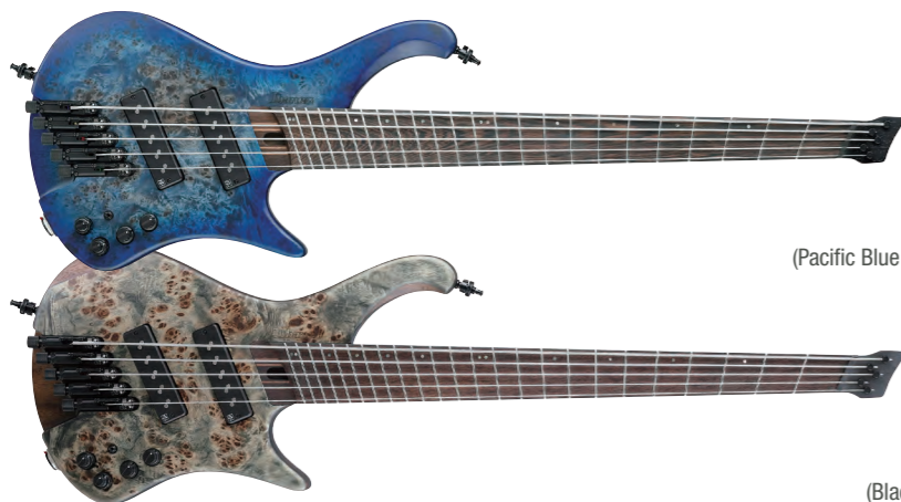
PLF (Pacific Blue Burst Flat)