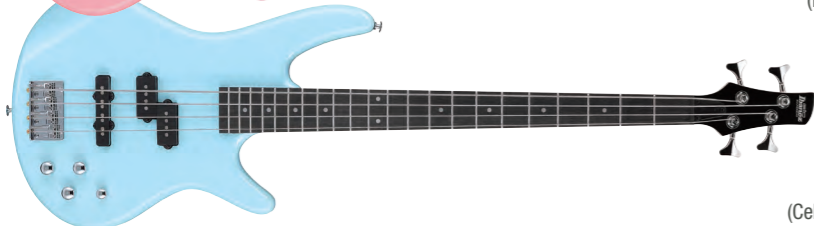
CEB (Celeste Blue)