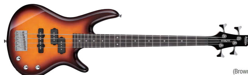
BS (Brown Sunburst)