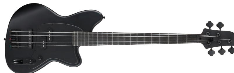
BKF (Black Flat)