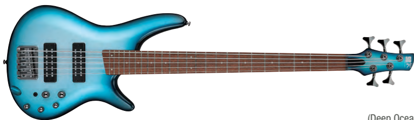
DOT (Deep Ocean Metallic) NEW FINISH