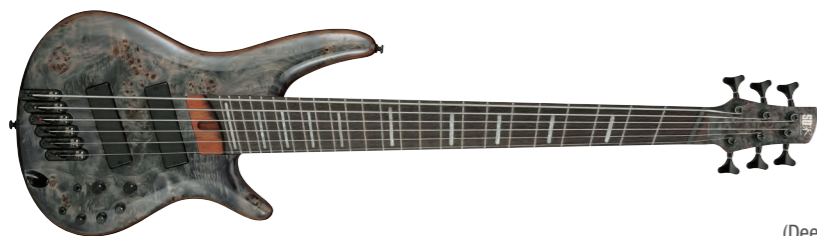
DTW (Deep Twilight)