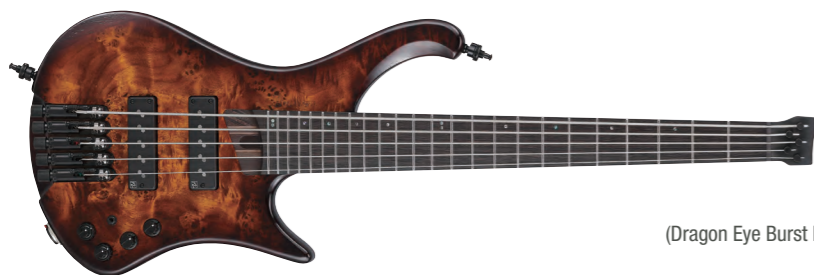
DEL (Dragon Eye Burst Low Gloss)