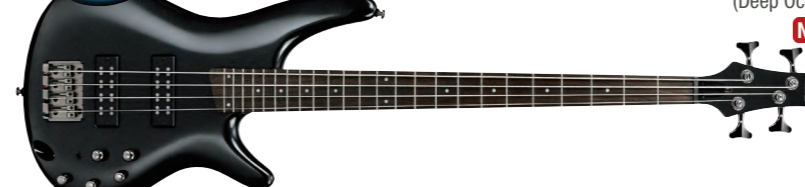
IPT (Iron Pewter)