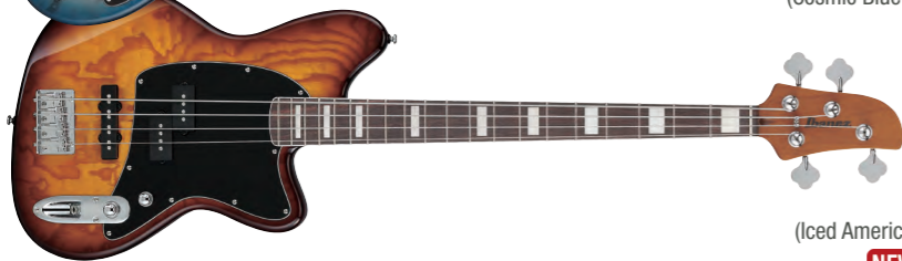
IAB (Iced Americano Burst)