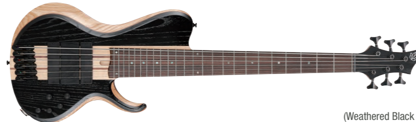
WKL (Weathered Black Low Gloss)