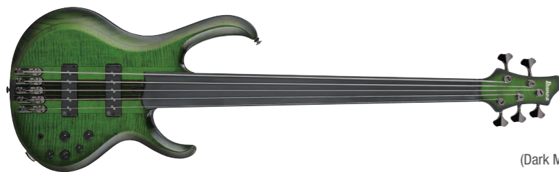
DMT (Dark Moss Burst)