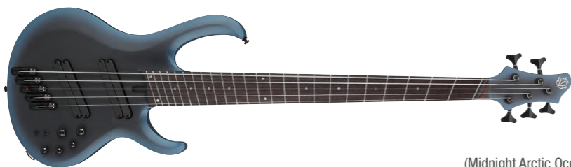
MAM (Midnight Arctic Ocean Matte) NEW FINISH