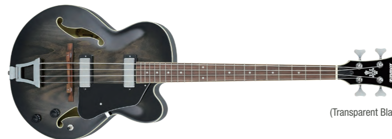
TKS (Transparent Black Sunburst)