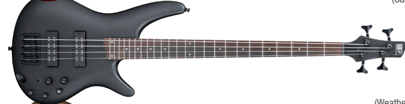
WK (Weathered Black)