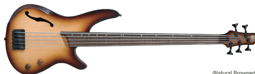
NNF (Natural Brownd Burst Flat)