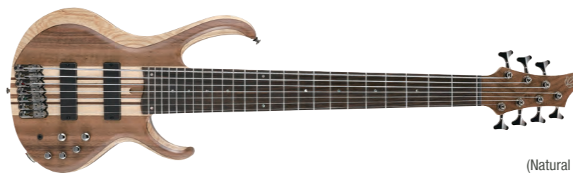
Premium NTL (Natural Low Gloss)