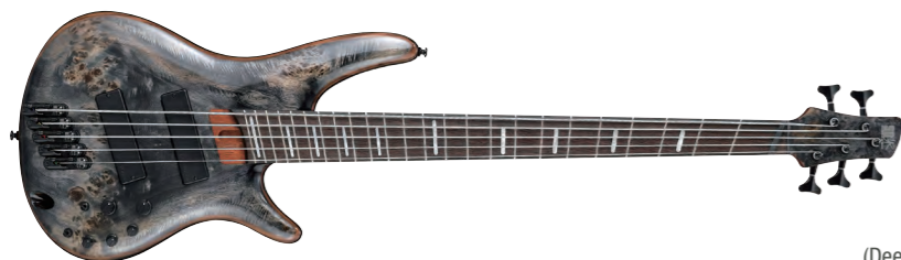
DTW (Deep Twilight)