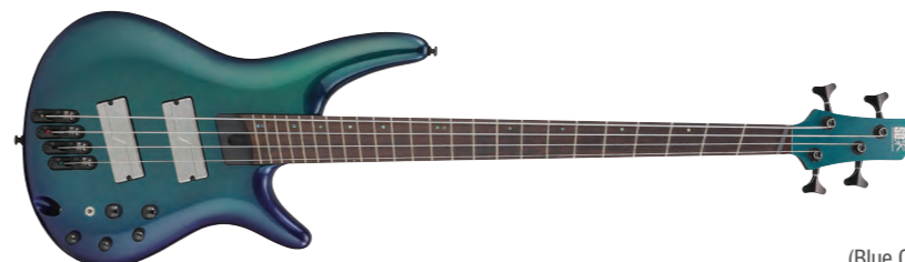
BCM (Blue Chameleon)