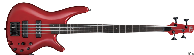
CA (Candy Apple)