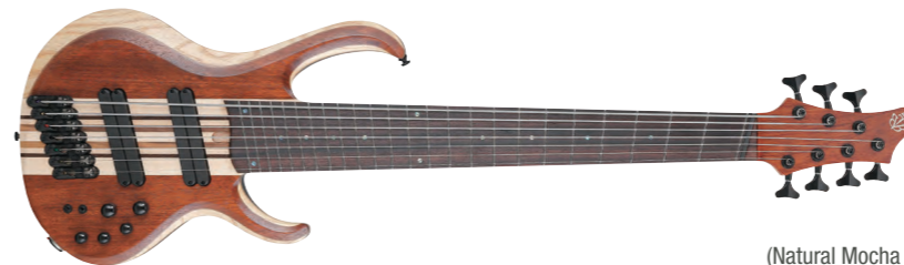
NML (Natural Mocha Low Gloss)