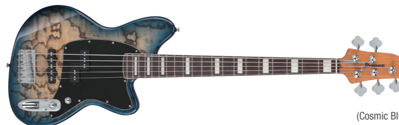
CBS (Cosmic Blue Starburst)