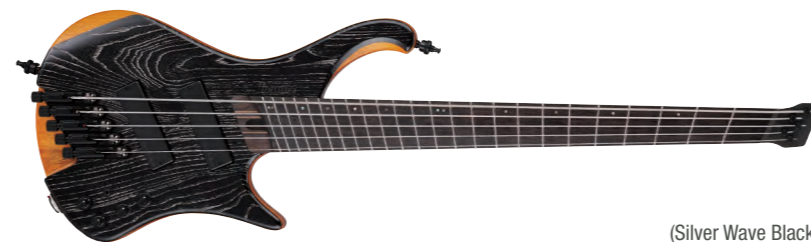
SKL (Silver Wave Black Low Gloss)