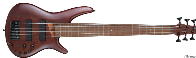
BM (Brown Mahogany)