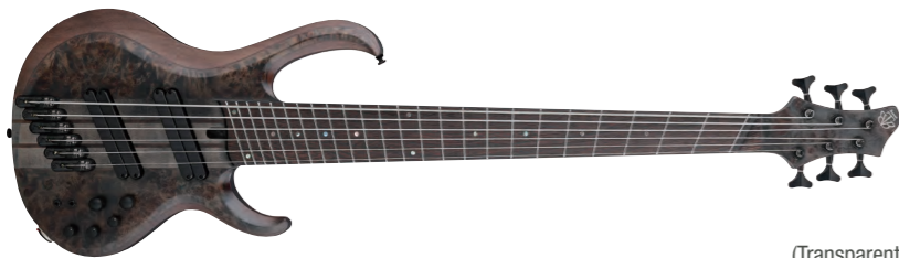
TGF (Transparent Gray Flat)