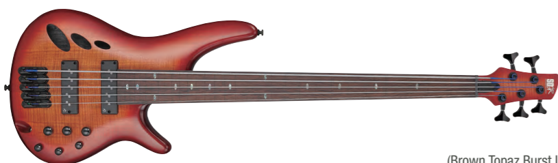
BTL (Brown Topaz Burst Low Gloss)