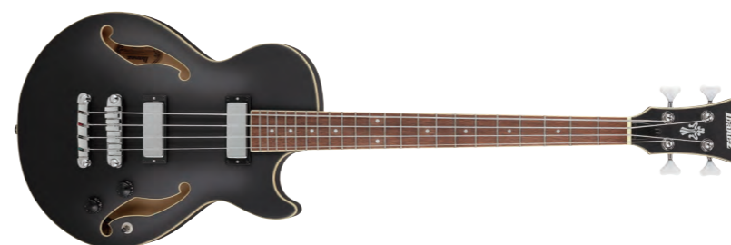
BKF (Black Flat)