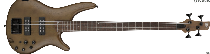
WNF (Walnut Flat) NEW FINISH