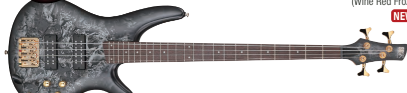
BZM (Black Ice Frozen Matte)