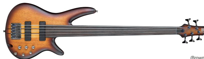
BBF (Brown Burst Flat)