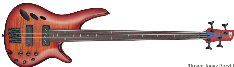
BTL (Brown Topaz Burst Low Gloss)