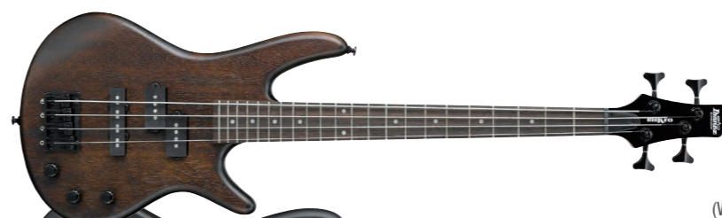
WNF (Walnut Flat)