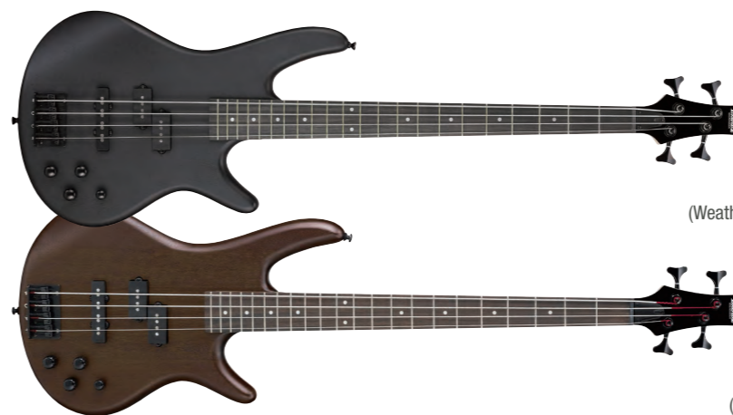
WK (Weathered Black)