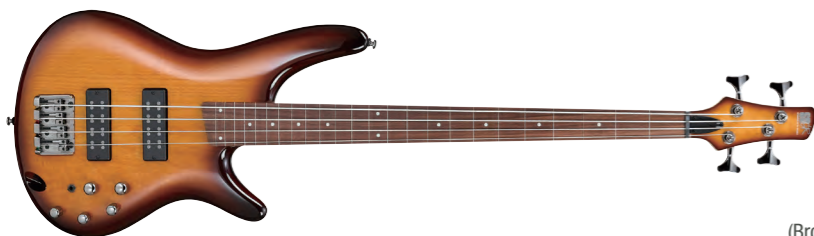
BBT (Brown Burst)