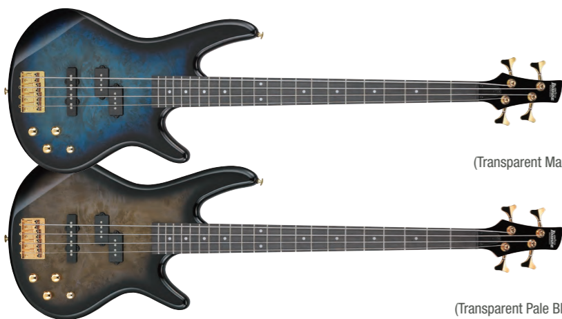
TMU (Transparent Marine Burst)