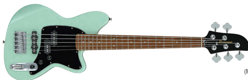
MGR (Mint Green)