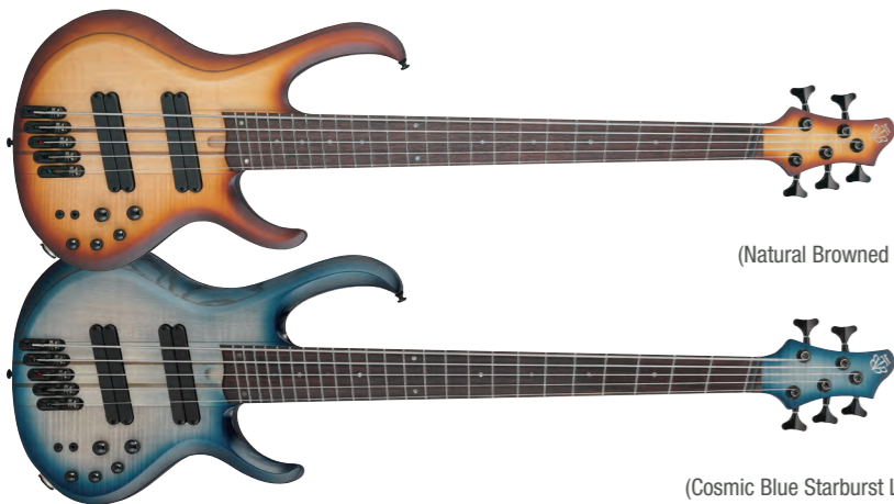
NNF (Natural Browned Burst Flat)