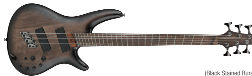
BLL (Black Stained Burst Low Gloss)