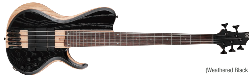
WKL (Weathered Black Low Gloss)