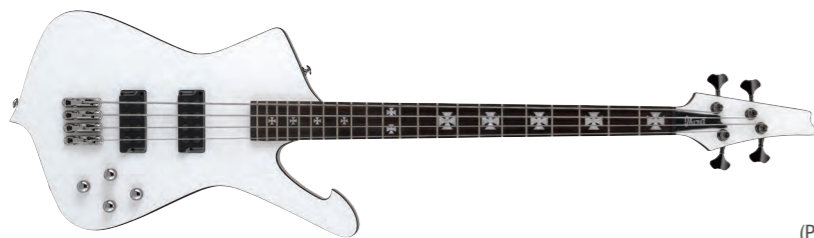
PW (Pearl White)