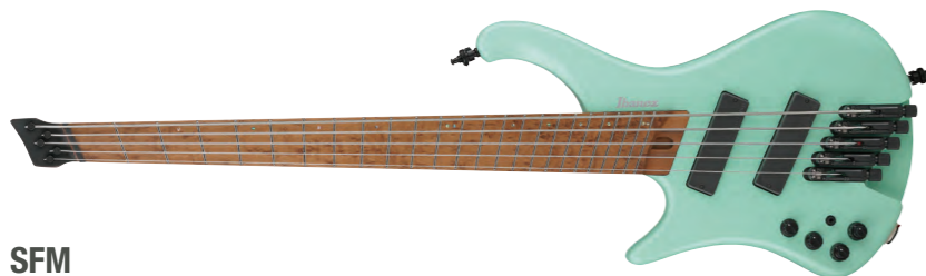
SFM (Seafoam Green Matte)