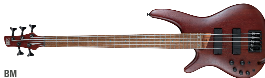
BM (Brown Mahogany)