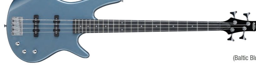
BEM (Baltic Blue Metallic)