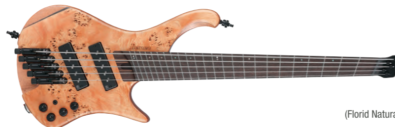
FNL (Florid Natural Low Gloss)