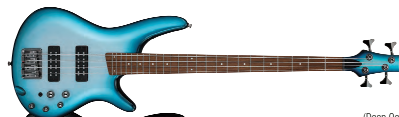
DOT (Deep Ocean Metallic) NEW FINISH