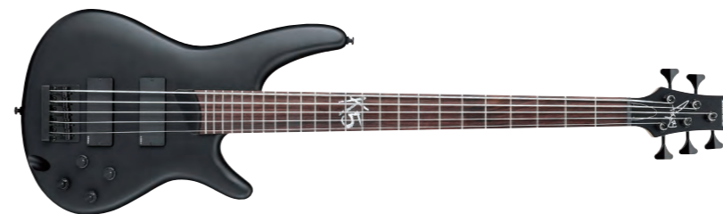
BKF (Black Flat)