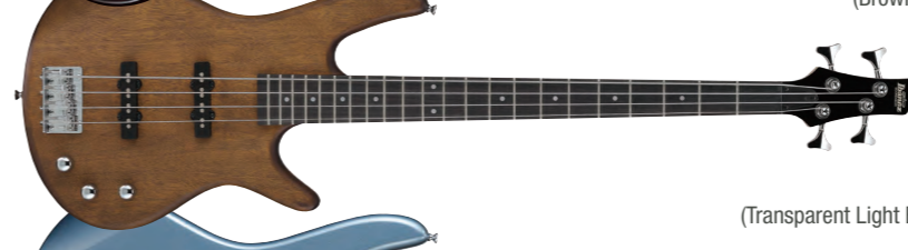
LBF (Transparent Light Brown Flat)