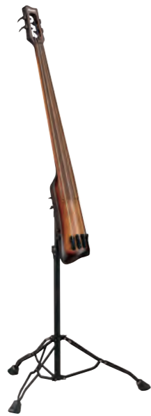
MOB (Mahogany Oil Burst)