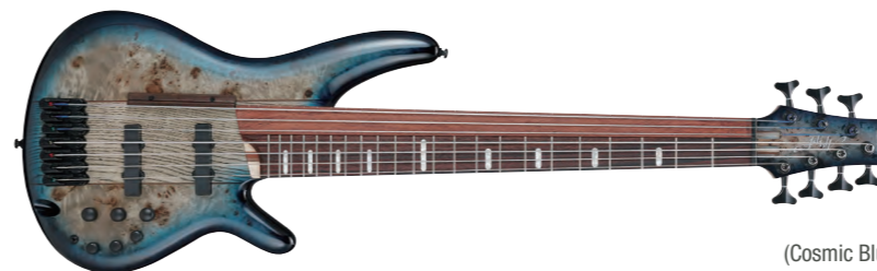
CBS (Cosmic Blue Starburst)