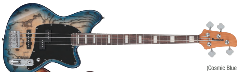
CBS (Cosmic Blue Starburst)