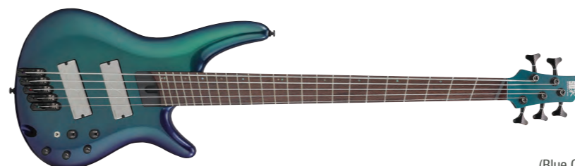
BCM (Blue Chameleon)