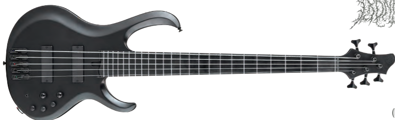
Premium BKF (Black Flat)