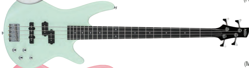
MGR (Mint Green)