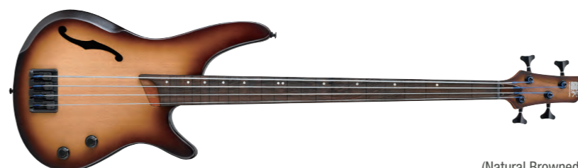
NNF (Natural Brownd Burst Flat)