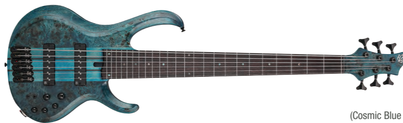
Premium COL (Cosmic Blue Low Gloss)