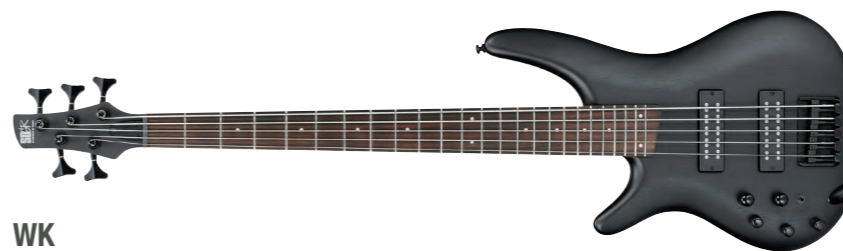
WK (Weathered Black)