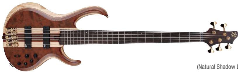
Premium NDL (Natural Shadow Low Gloss)