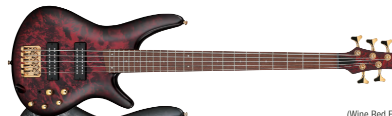
WZM (Wine Red Frozen Matte) NEW FINISH