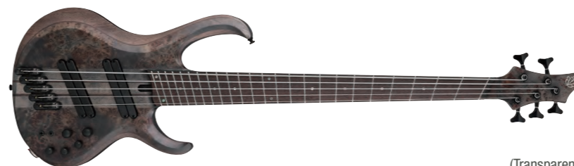
TGF (Transparent Gray Flat)