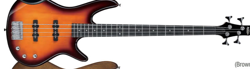
BS (Brown Sunburst)