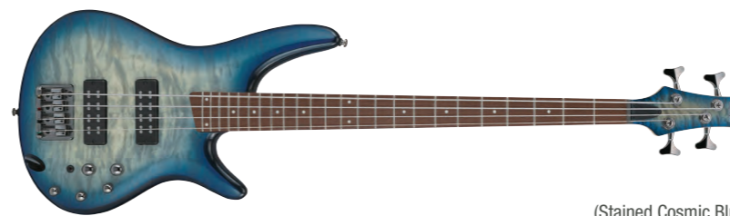
SCB (Stained Cosmic Blue Starburst) NEW FINISH