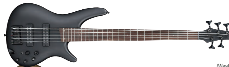
WK (Weathered Black)