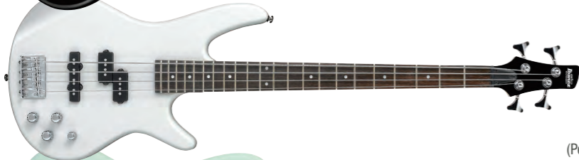
PW (Pearl White)