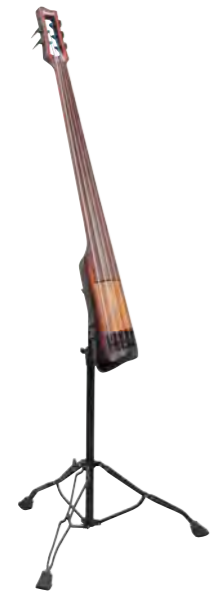
MOB (Mahogany Oil Burst)