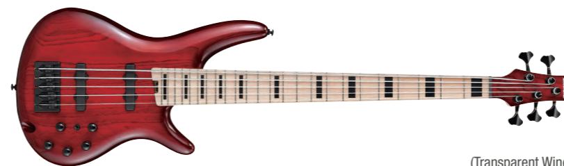
Premium TWB (Transparent Wine Red Burst)