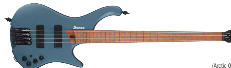
AOM (Arctic Ocean Matte)