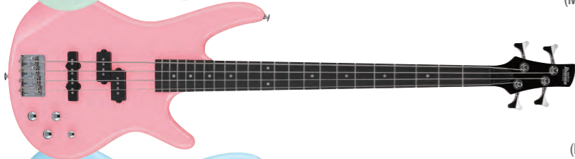
BPK (Baby Pink)