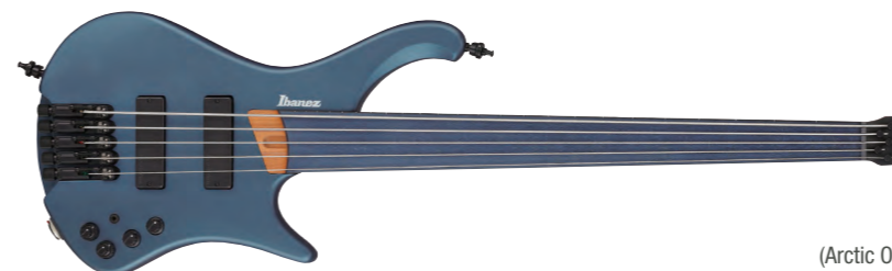
AOM (Arctic Ocean Matte)