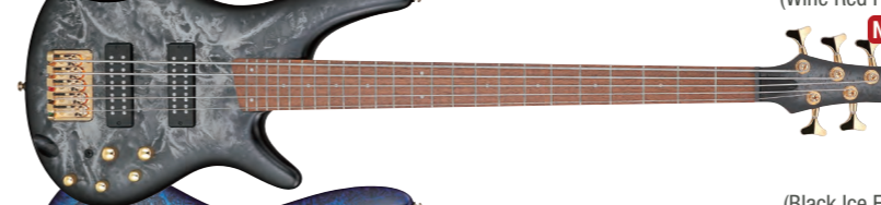
BZM (Black Ice Frozen Matte)