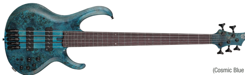
Premium COL (Cosmic Blue Low Gloss)