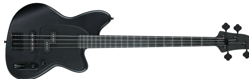
BKF (Black Flat)