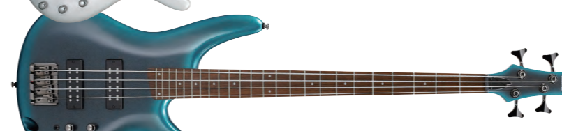
CUB (Cerulean Aura Burst)