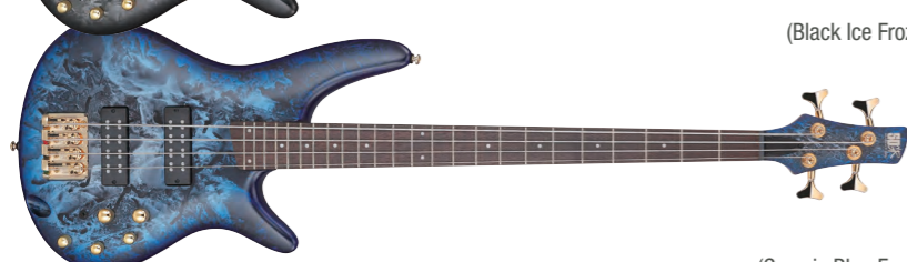
CZM (Cosmic Blue Frozen Matte)