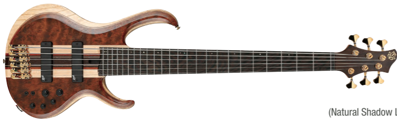
Premium NDL (Natural Shadow Low Gloss)