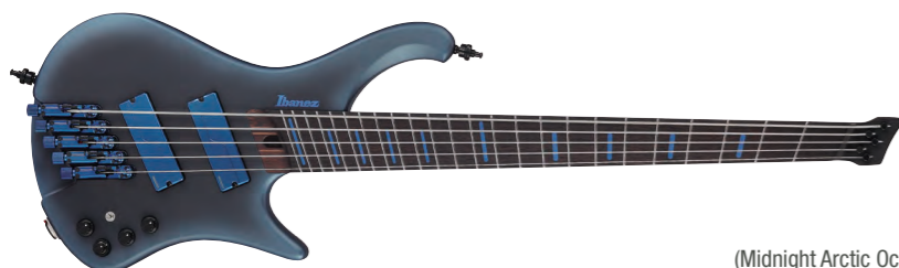
MAM (Midnight Arctic Ocean Matte)