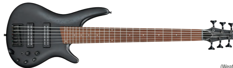
WK (Weathered Black)