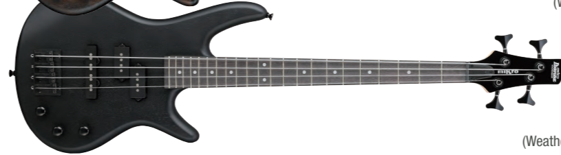
WK (Weathered Black)