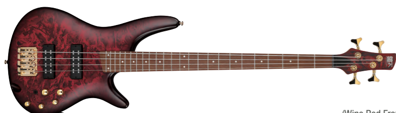
WZM (Wine Red Frozen Matte) NEW FINISH