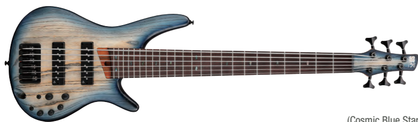
CTF (Cosmic Blue Starburst Flat)