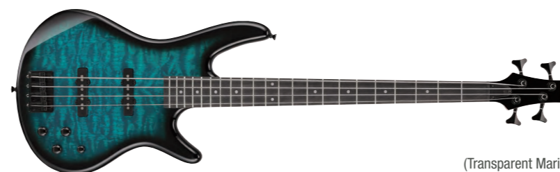
TMS (Transparent Marine Sunburst)