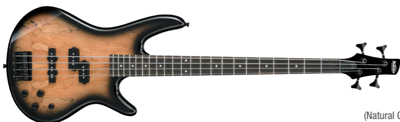
NGT (Natural Gray Burst)