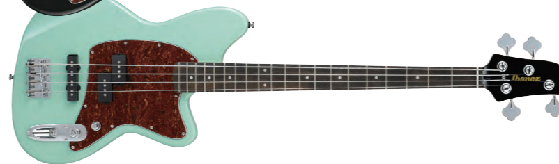
MGR (Mint Green)