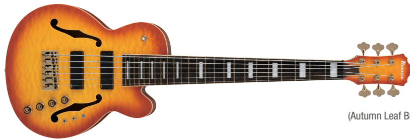
ALM (Autumn Leaf Burst Matte)