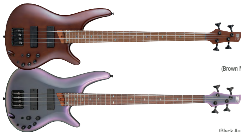
BM (Brown Mahogany)