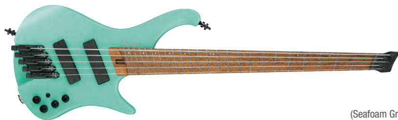
SFM (Seafoam Green Matte)