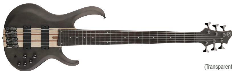
TGF (Transparent Gray Flat)