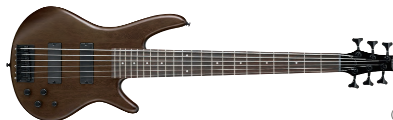
WNF (Walnut Flat)