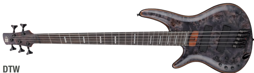
DTW (Deep Twilight)