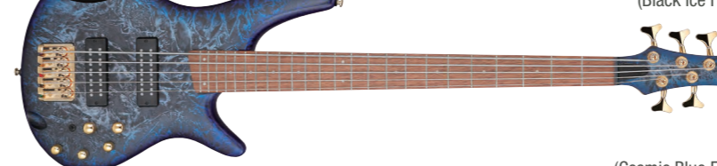
CZM (Cosmic Blue Frozen Matte)