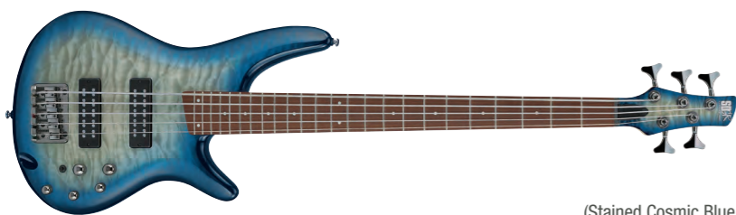
SCB (Stained Cosmic Blue Starburst) NEW FINISH