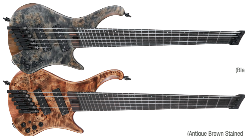
BIF (Black Ice Flat)