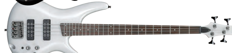
PW (Pearl White)